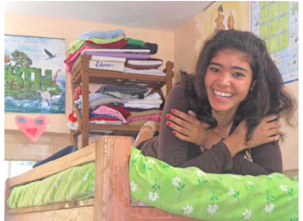
The girls are SO happy in their new home!