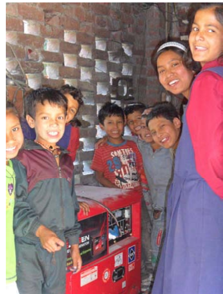
The Youth VIP donation of a new generator is generating big smiles!

A gift of water is a gift of life these days in India. So many thanks to Farmaceuticos de Valladolid in Spain for their donation of a new pumping system!