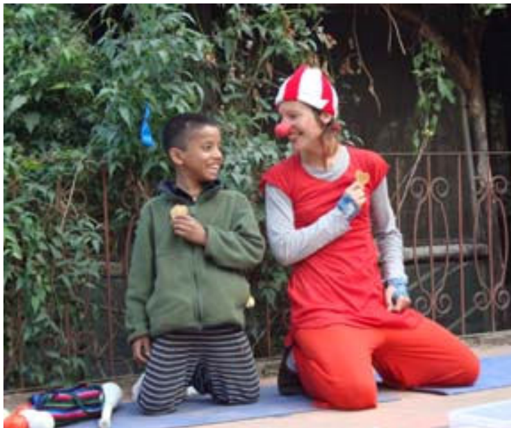
It is all about love, and a little goes such a long way here.